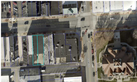
Aerial Site Location

West DT Downtown & Historic District – Commercial