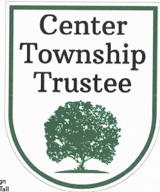
Double Sided Sign 24" Wide x 29.25" Tall